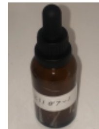
Cannabinoids (% weight)