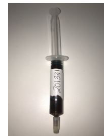
Cannabinoids (% weight)